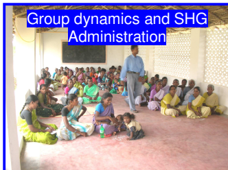
Group dynamics and SHG Administration

Last year we have started SHG facilitation centre for the development of SHGs. It's pioneering service for the women Self help group members for their liberation and economical growth. 45 group leaders were befitted in