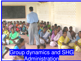
Group dynamics and SHG Administration