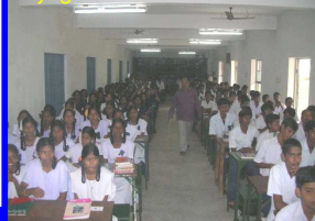
St.Joseph High school Kariyandal