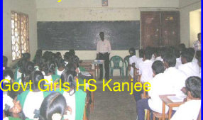
Govt Gals HS Kanjee